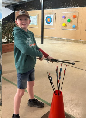
3/4 Camp Billabong