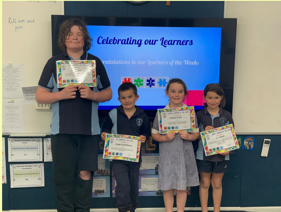
Term 4, Week 1: Congratulations to our Learners of the Week!