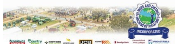
Elmore Events Centre - 48 Rosaia Rd