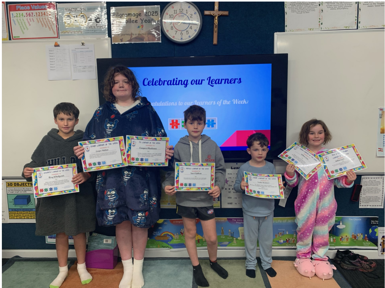
Term 3, Week 1: Congratulations to our Learners of the Week!