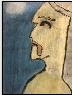
DAWN IMAGE MACKILLOP ART 2023

Then Jesus spoke, 'What do you want me to do for you?' 'Rabbi the blind man said to him 'Master, let me see again.' Jesus said to him, 'Go; your faith has saved you.' And immediately his sight returned and he followed him along the road.