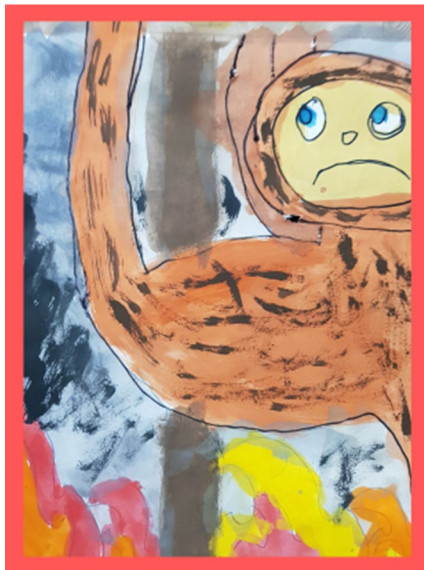
Trey's image shows the plight of the orangutans losing their homes due to deforestation